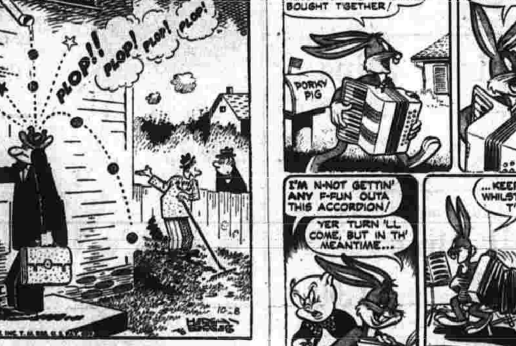
"Salesmen don't linger long unless I fixed up that automatic pool-ball dispenser!"