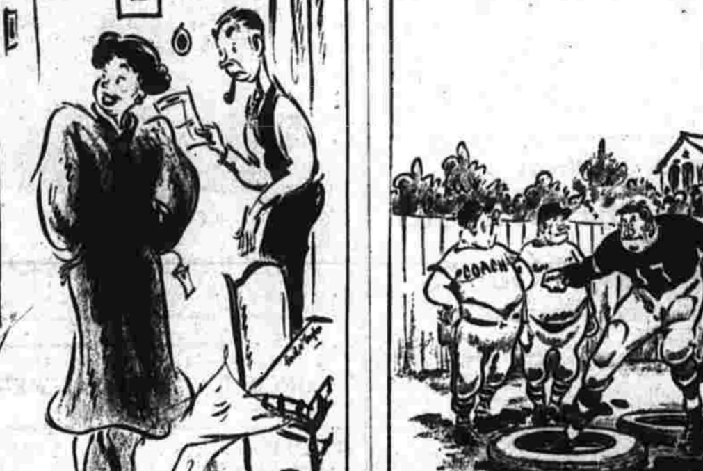
"If it gets you down worrying about the price of the coat, just think how many billions Uncle Sam owes and nobody seems to mind!"