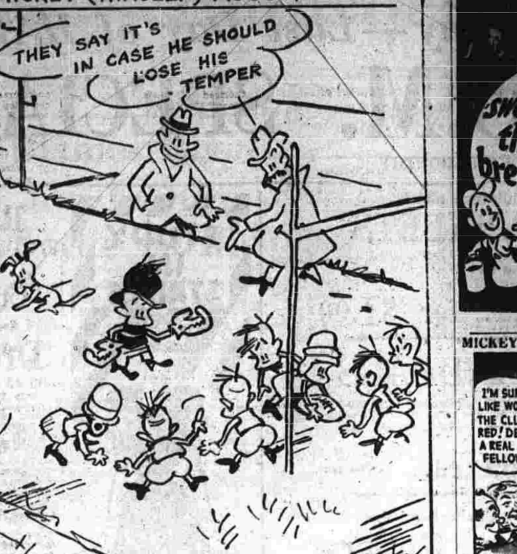
10-28-49 (Reprinted by the Salt Publishing Co.)